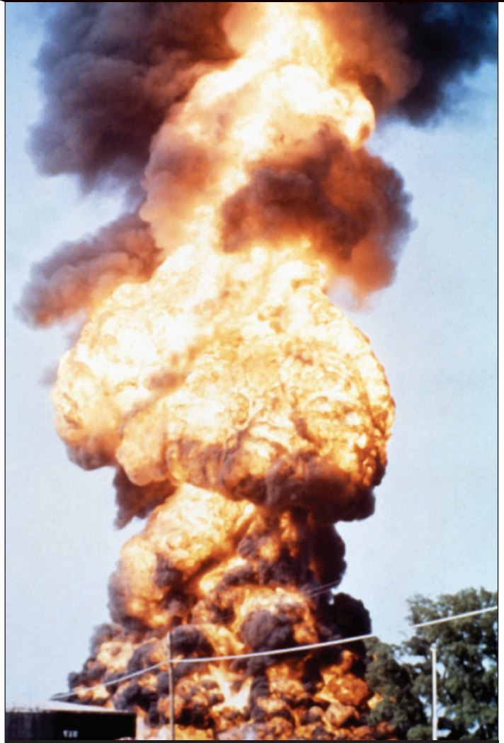
This massive boilover caught many by surprise

The heat generated at the surface moves slowly downward through the crude in a “heat wave” at a steady pace. When this heat wave reaches any encapsulated water source — such as within the tank’s sump located